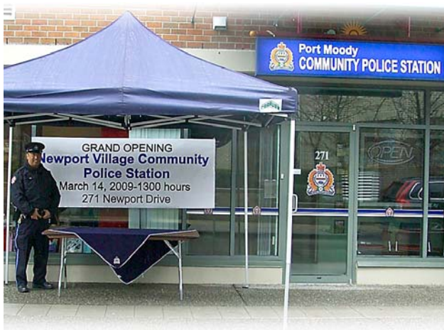
Opening of Newport Village Community Police Station – March 14, 2009