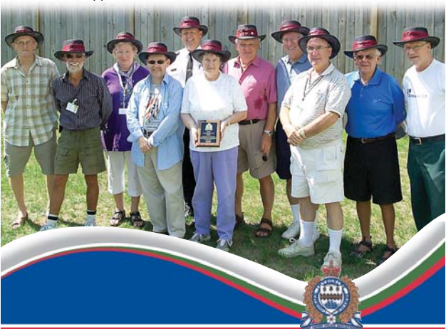
▲ Volunteer Appreciation BBQ